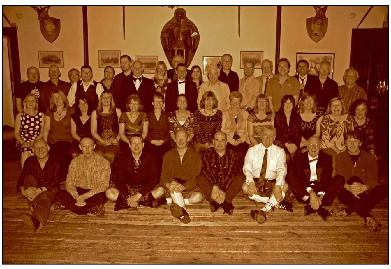
Visit www.cioch.co.uk for the newsletter online